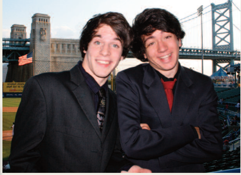
Middletwo , the 2011 NJSDD 2nd Place Winners from Monmouth County performed their song across the state, including at a Camden CAN sponsored Riversharks Game in July.